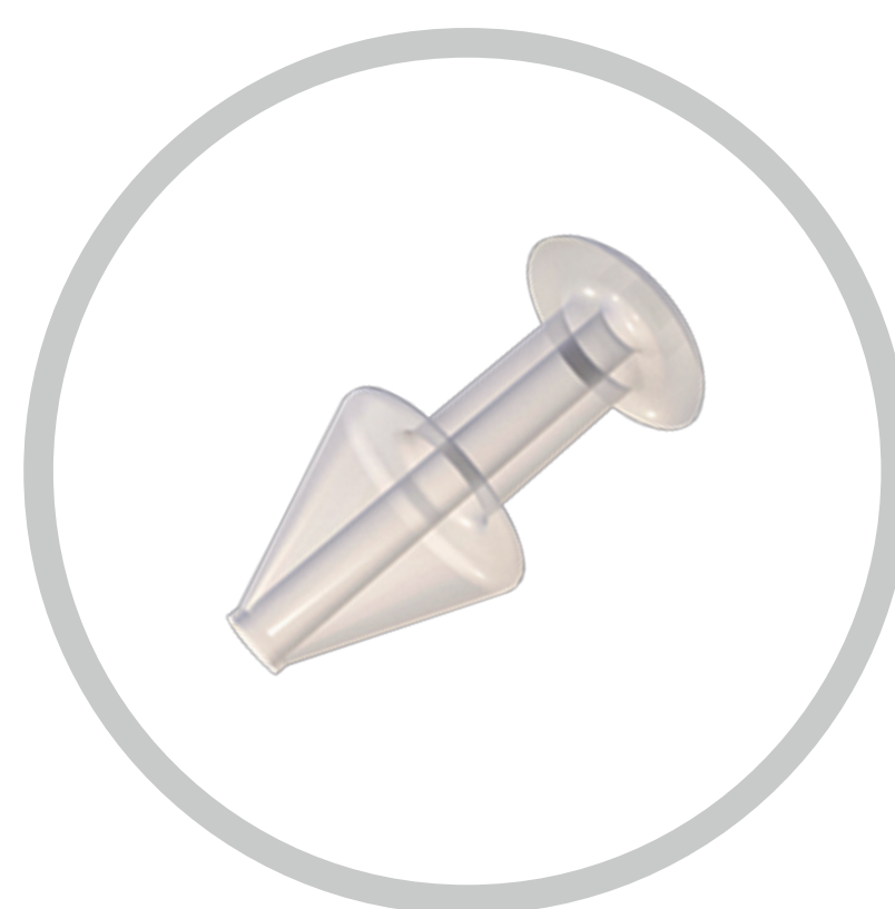
Partial Micro Flow™